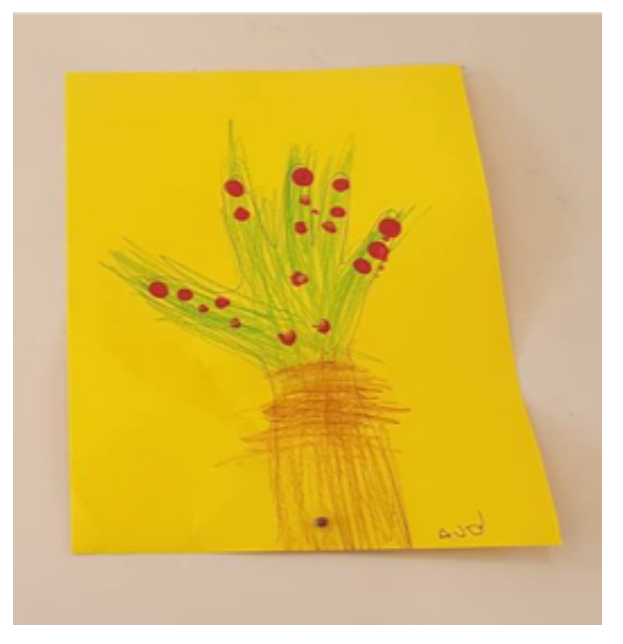
Trace hands to make apple trees