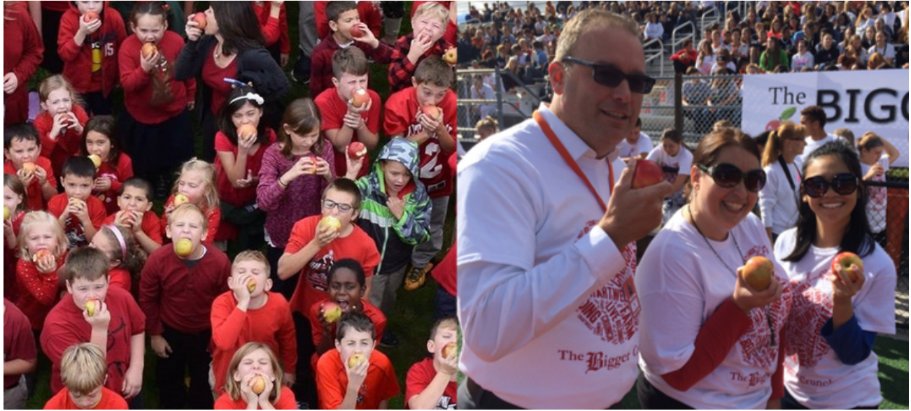
Belding Area Schools celebrate Apple Crunch

Please note: This PDF includes clickable links to additional online resources. Clickable links are blue and followed by a blue arrow (</