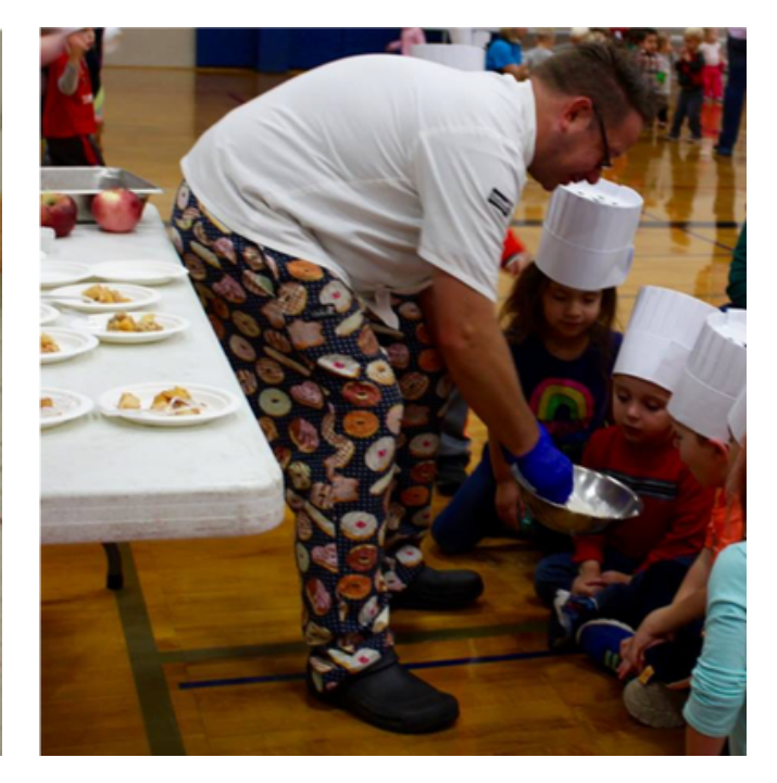
Invite a chef to prepare a healthy apple recipe with children.