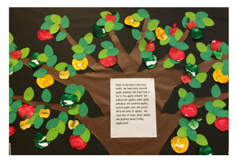
Decorate an apple tree with colorful apples painted by children